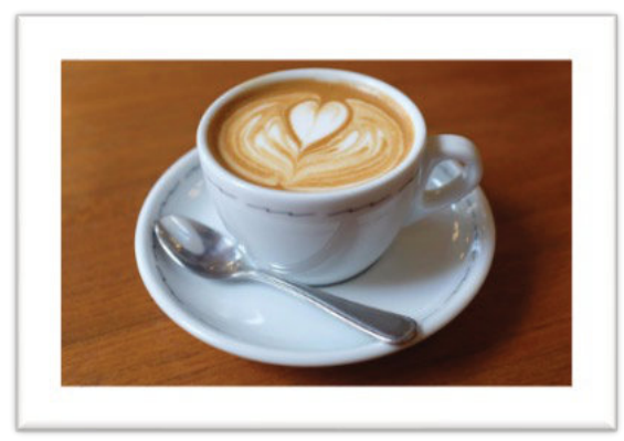
March 8, 2024 ~ 11:00 a.m. River House Bakery & Café 120 Bell Street, Sequim

LWML - Serving the LORD with Gladness! Psalm 100:2