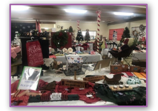
St Matthew LWML Port Angeles